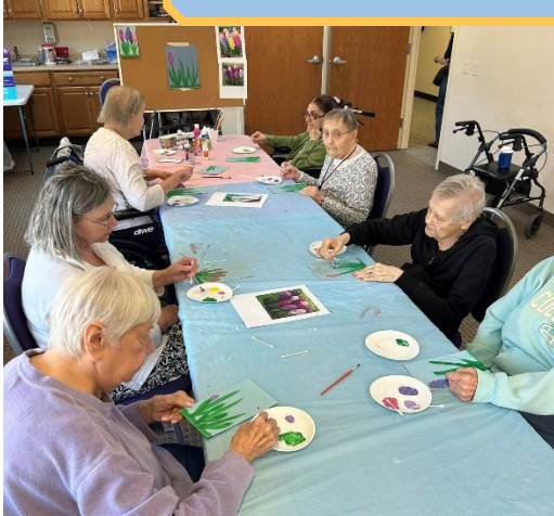
Fun at Fountain View