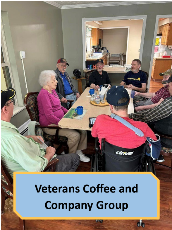
Veterans Coffee and Company Group